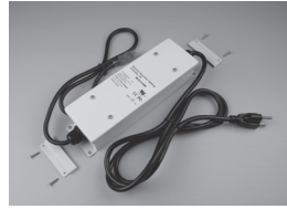
MLS12-60W Class 2, 60 watt LED driver 11"L x 3"W x 2"H