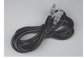
MLS12-STP-2' 2 ft. Step Cord MLS12-STP-12' 12 ft. Step Cord