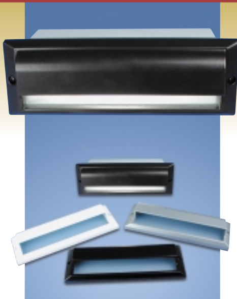
Scoop Cover: White, Black, Bronze, Aluminum Cover: 9"L x 3"W x 1.5"D Can: 7.7"L x 2.4"W x 3.2"D