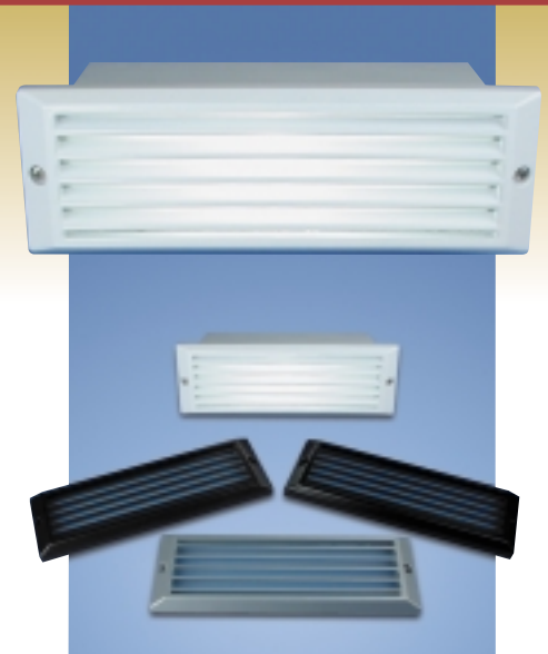
Louver Cover: White, Black, Bronze, Aluminum Cover: 9"L x 3"W x .75"D Can: 7.7"L x 2.4"W x 3.2"D