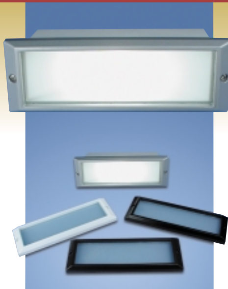
Prism Cover: White, Black, Bronze, Aluminum Cover: 9"L x 3"W x .75"D Can: 7.7"L x 2.4"W x 3.2"D