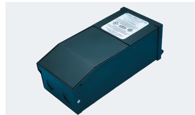
TR-24-480 11.1" x 4.75" x 4.25" 1 circuit at 480 watts for 24V AC