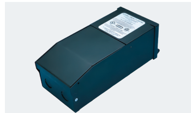
TR-24-600 11.1" x 4.75" x 4.25" 2 circuits at 300 watts each for 24V AC