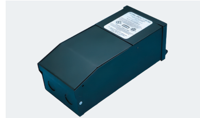
TR-12-150 10" x 3.1" x 3" 1 circuit at 150 watts for 12V AC