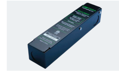
TECLT-12-60 6.5" x 1.5" x 1.5" Class 2, 1 circuit at 60 watts, for 11.7V AC