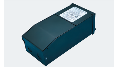
TR-12-300 or TR-24-300 10" x 4.25" x 3.6" 2 circuits at 150 watts each for 12V AC