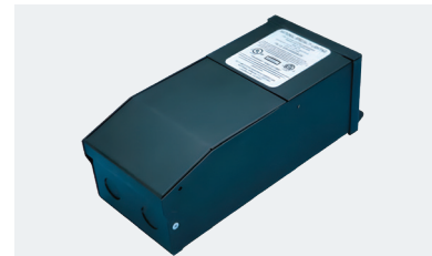
TR-24-960 12.5" x 7.0" x 4.75" 2 circuits at 480 watts each for 24V AC