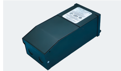
TR-12-240 10" x 4.25" x 3.6" 1 circuit at 240 watts for 12V AC