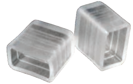
YH-ENDCAP End Cap