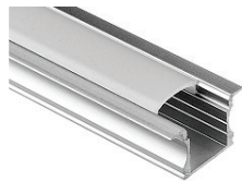
LV-LB-W3-FR* Recessed aluminum extrusion and frosted PC cover *Available in 1M (39") lengths.