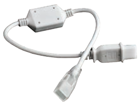
YH-POWERPLUG-15A 15A Power Plug