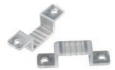
YH-FIXCLIP Mounting clips