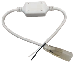
YH-2835D-PWP 15A Hardwire Power Cord