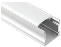
LV-LB-D3-FR* Surface mount aluminum extrusion and frosted PC cover *Available in 1M (39") and 2M (78") lengths.