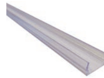
LES-STPV-T* PVC "U" mounting channel *Available in 1M (39") lengths.