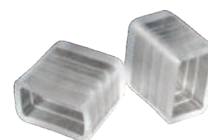
YH-ENDCAP End Cap