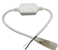
YH-2835D-PWP 15A Hardwire Power Cord