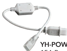
YH-POWERPLUG-15A 15A Power Plug