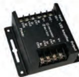
LT-390A Signal amplifier for RGB

NOTE: See page 34-35 for the complete range of aluminum extrusions.