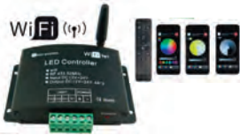
LN-CON-WIFI-3CH-XV WiFi controller for RGB, c/w RF remote 12/24VDC