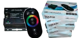
LT-095-RF 6 Key RGB "touch" controller 12/24V DC